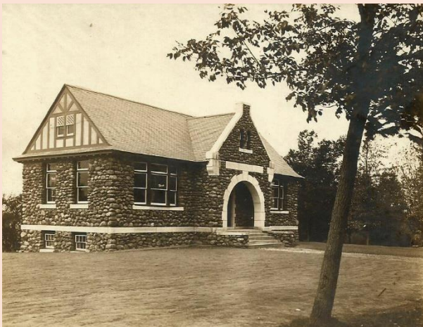
SAWYER MEMORIAL LIBRARY Front View