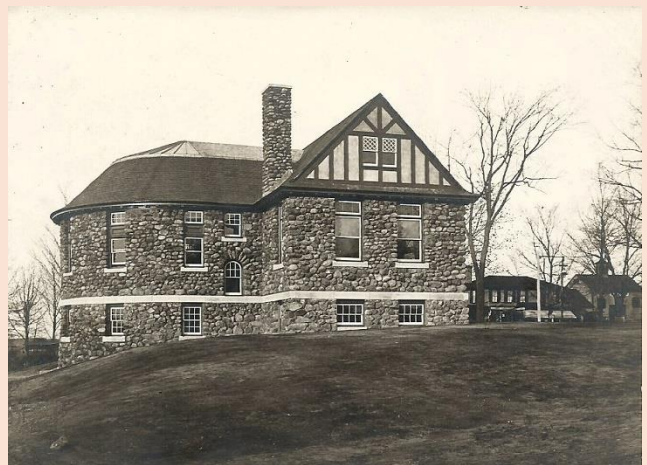
SAWYER MEMORIAL LIBRARY Side View Note: Hastings Center Store & Red Barn Restaurant in background